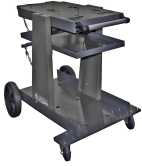
580006 (optional) Transport cart