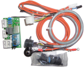
540051 (optional) Computer-pantograph kit