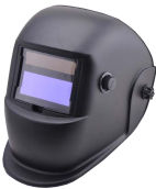
309073 (optional) Helmet with variable shade auto-darkening LCD filter (9-13 DIN) to protect face and eyes during cutting and welding appliances.