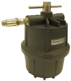
357227 (optional) Compressed air filter with filtering cartridge to protect torches against impurities present in compressed air (oil and/or water).