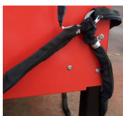
309096 (optional) Sheathes kit for cables protection.