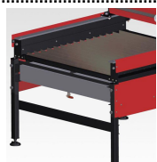
540064 (optional) Water tank for collecting dust with tap.