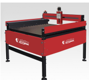
Base401 Base: cutting field 1x1 m with 3 axis and 4 motors.