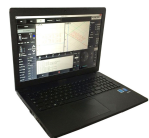
309066 (optional) Laptop with pre-installed DEFINITION CUT software for 3 axis.