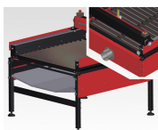
540065 (optional) Fume extractor kit with flange.