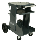
580002 (optional) Transport cart